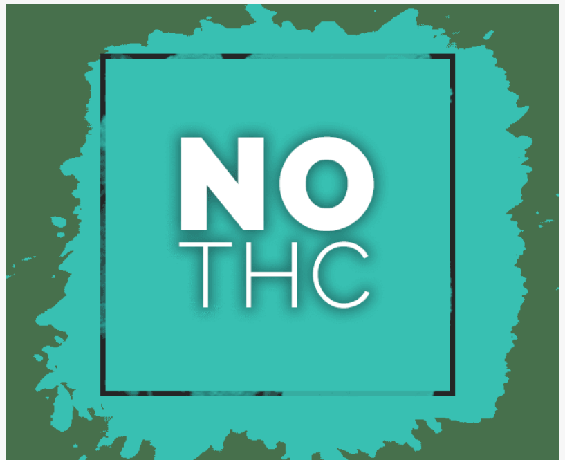
CBD Gummies For Sale in Pennsylvania