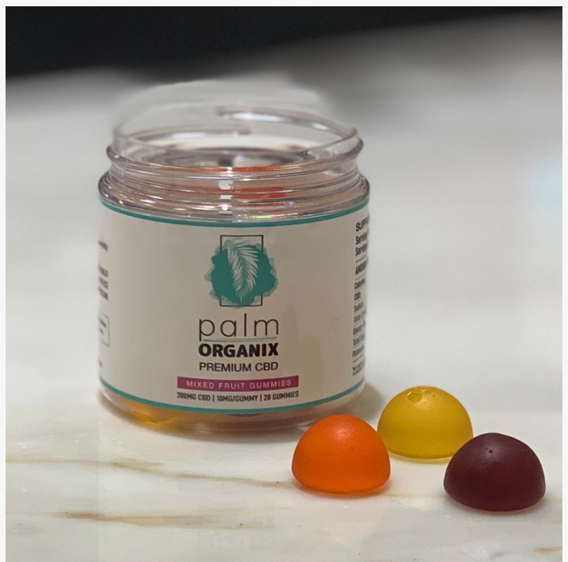
CBD Gummies in Pennsylvania

Palm Organix™ customers trust our CBD products as they help promote greater health and overall well-being. CBD may be helpful in providing a much-needed relief from any number of ailments including, promoting tranquility and healthy skin, as well as supporting a good night's sleep, internal balance, relaxed mood as well as muscle and joint function.