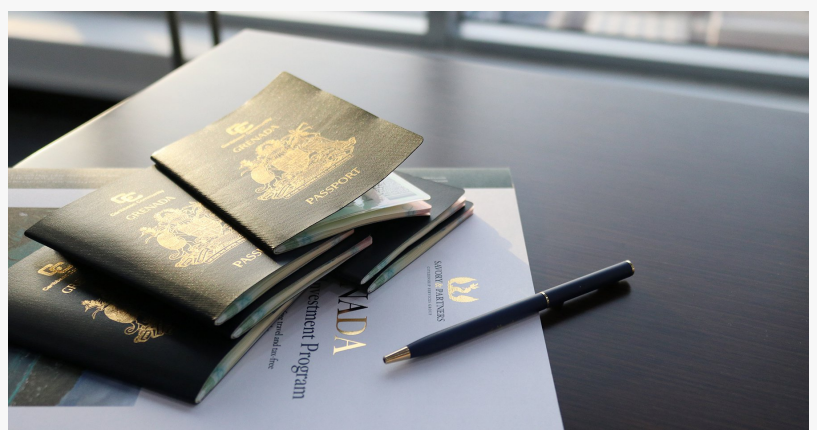
Savory & Partners: Citizenship by Investment

South Africa - Madagascar and Mauritius – and the Far East - Malaysia and Japan. Everybody has a different motivation to acquire a second passport. However, the company's headquarters are in Dubai, because many of its clients are Middle East nationals who apply for second passports due to the instability in their home countries.