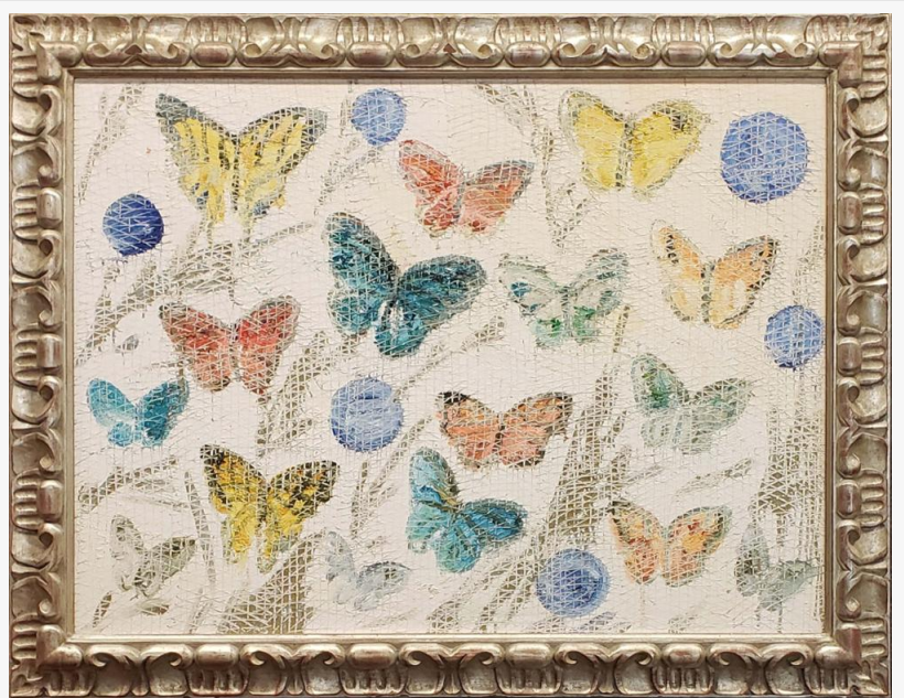
Neo-expressionist painting by Hunt Slonem (American, b. 1951), titled Butterfly's (2003), 30 inches by 40 inches, done in Slonem's unmistakable sgraffito technique ($15,000).

The 30 inch by 40 inch oil on canvas composition of blue, red green and yellow butterflies amongst foliage over a white background was executed using Slonem's unmistakable sgraffito technique. His work is included in over fifty permanent museum collections (including the Met in New York City) and is a featured component of several very important corporate collections.