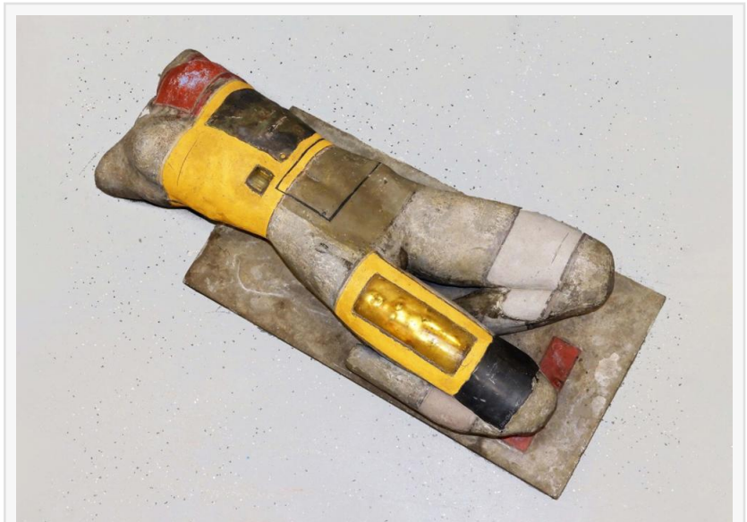
Post-modern figurative female sculpture by Alabama artist Dan Corbin (b. 1947), a reclining nude with a polychrome painted design, molded and sculpted of Bauxite ($2,375).

A well-crafted, early 20th century solid wood set of eight faux bamboo caned Chippendale style