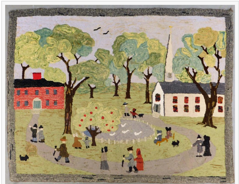
American folk-art hook rug tapestry, executed in the early 20th century by Lib Callaway and titled Meeting Day, a 38 ¼ inch by 49 inch signed pictorial carpet ($1,750).

Travis Landry Bruneau & Co. Auctioneers +1 401-533-9980 email us here