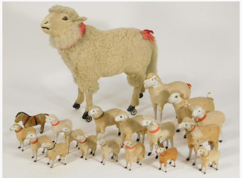
19-piece, German-made children's sheep doll group consisting of 16 small sheep toys with papier-mâché faces, miniature donkey toy, miniature goat toy and large sheep pull-toy ($1,625).

This press release can be viewed online at: http://www.einpresswire.com