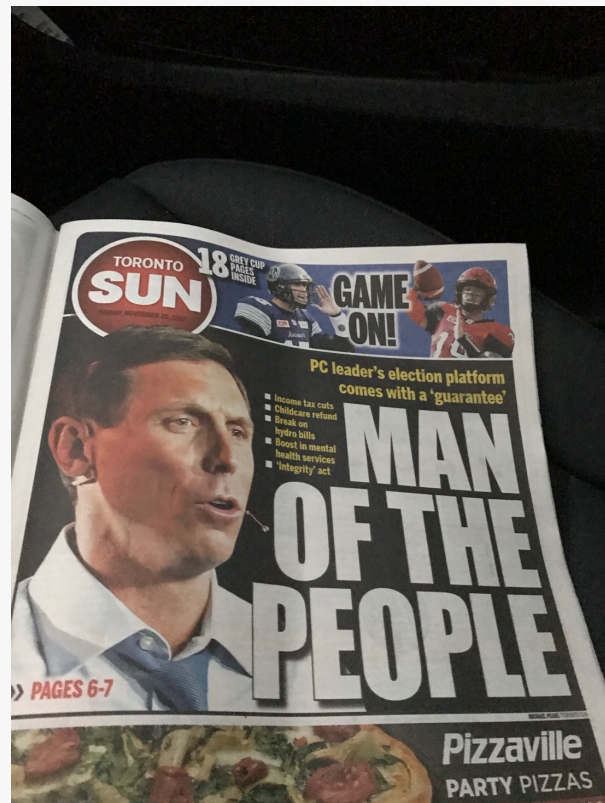
The Peoples Guarantee Platform was unveiled at the convention