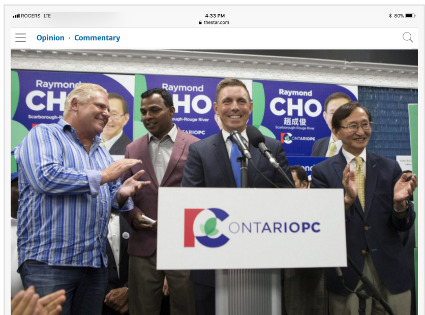
Doug Ford eyeing the prize