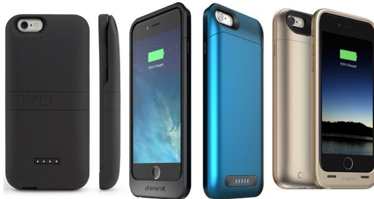
Mobile Phone Battery Cases Market