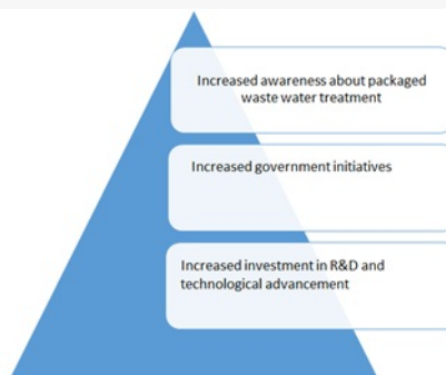
Packaged Water Treatment System Market Drivers