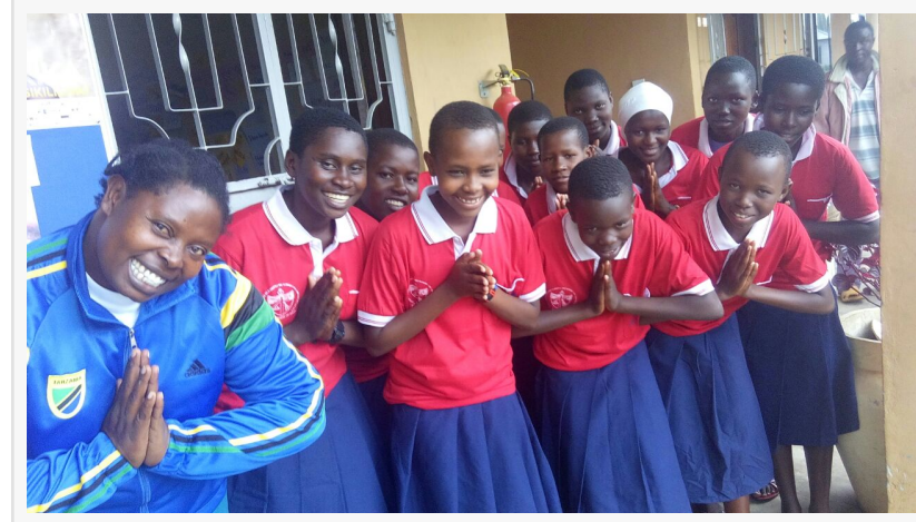
Girls at the FGM Safe House in Mugumu

project in late 2015, its volunteer base grew to over 2000 mappers across the world, as well as locally in Tanzania. The project has put over 1.5 million buildings and over 105 000 km of roads on the map in rural Tanzania via OpenStreetMap.