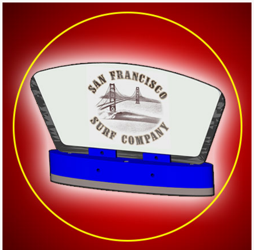
Car Board - Magnetic Car Auto Signs

The Car Board automobile signage can also be used for much more than sports teams. It can be used for business advertisement, product promotion and much more.