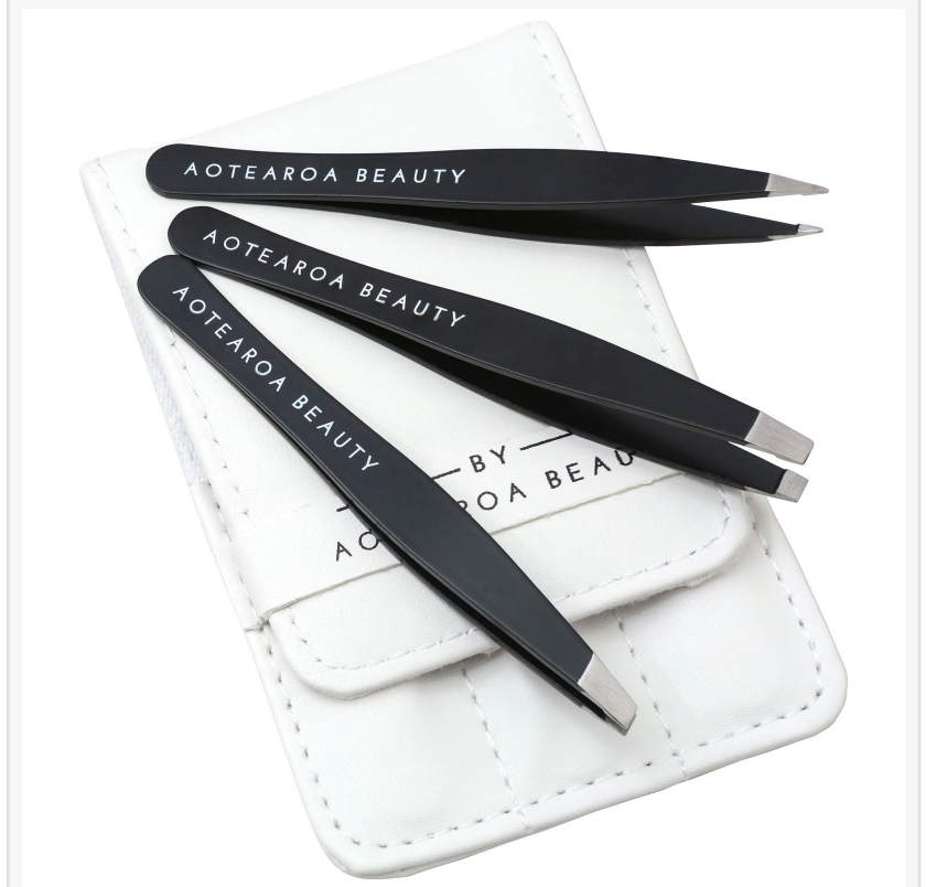
Tweezers White kit

This press release can be viewed online at: http://www.einpresswire.com