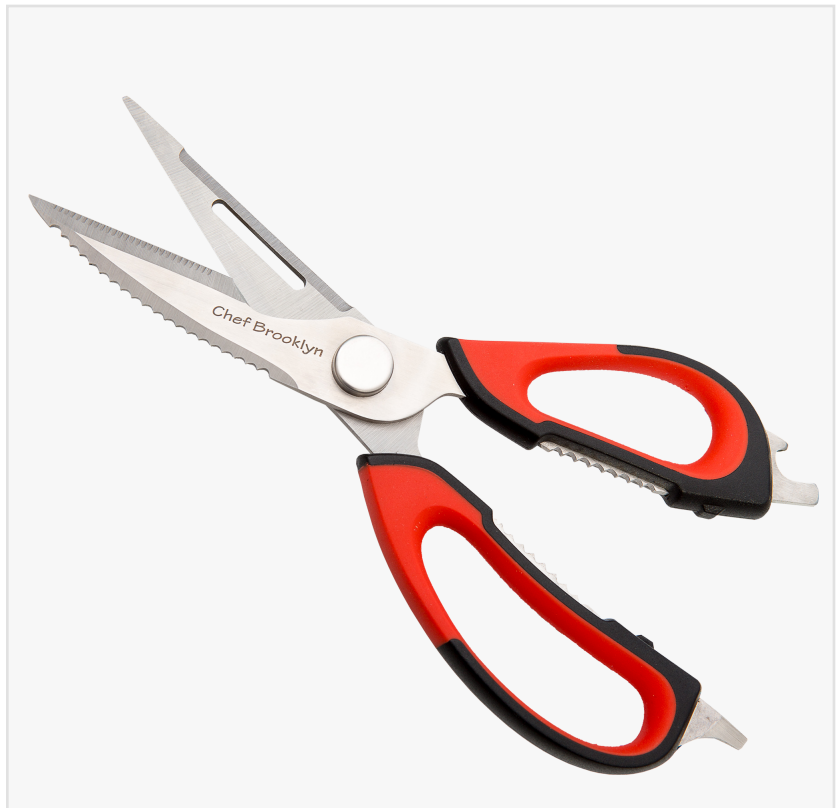
Chef Brooklyn Kitchen Shears