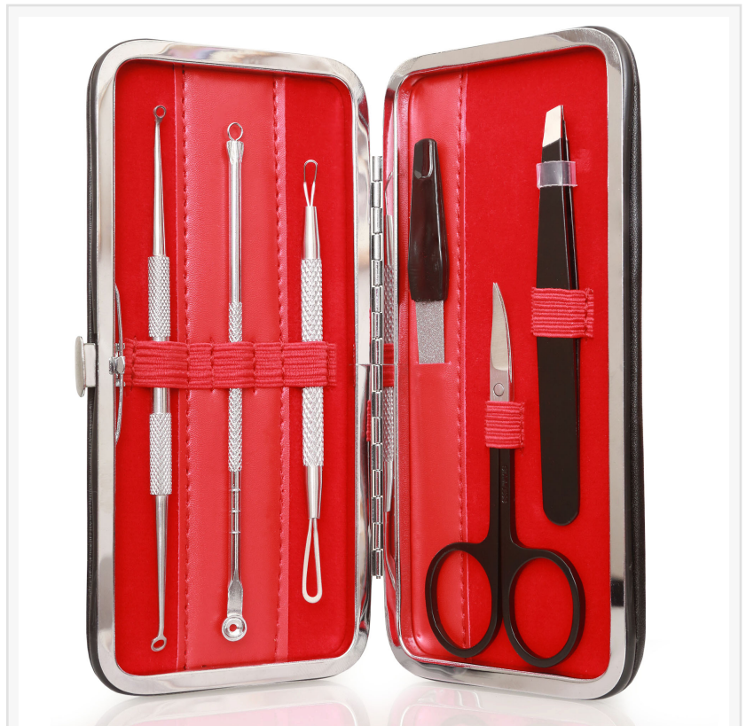
comedone extractor tools