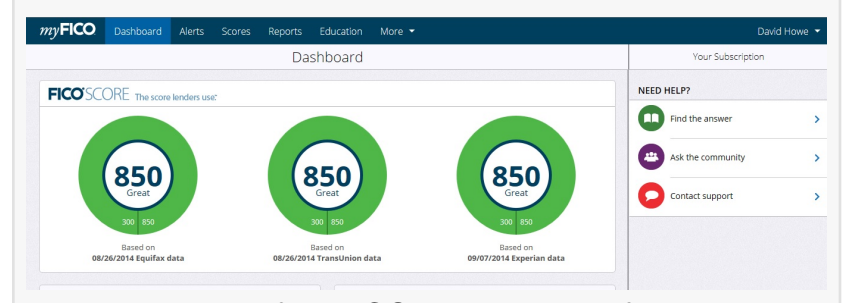
Howe obtains perfect FICO scores at Equifax, Experian, and TransUnion

Vantage 3.0 are strikingly consistent when the same repository is scored simultaneously. For example, if a consumer scores an 'Exceptional' rating with FICO Score 8 at TransUnion, then the TransUnion Vantage 3.0 will yield the same 'Exceptional' in virtually every single instance.